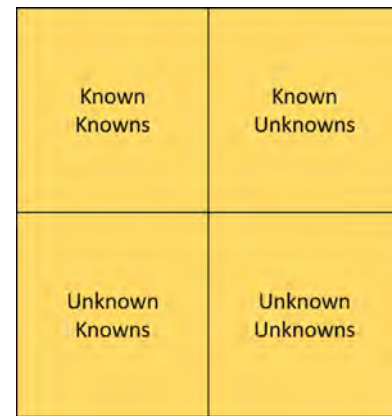
Fig. 1. Types of Information: known-knowns are known to exist, and information is available, known-unknowns are known to exist, but no information is available, unknown-knowns are not included in the analysis but the information is possible if they did, and unknown-unknowns are not known to exist, and no information is available if they did ( Marshall et al., 2019 ).

In a broad sense, uncertainty may be defined simply as limited knowledge about future, past, or current events ( Walker et al., 2003 ). Fig. 1 shows four different quadrants of information leading to uncertainty. This diagram is the focal point in business strategy and planning literature ( Marshall et al., 2019 ). Sustainability systems and issues extend to all four quadrants of information, whether the problem is of community sustainability, manufacturing sustainability,