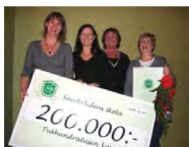
Sandaliden skola 2008