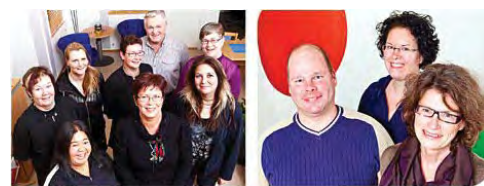
Städservice samt Miljö- och hälsoskydd 2010