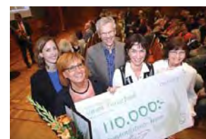
Umeå Turistbyrå 2007