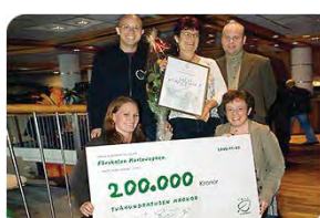
Förskolan Karlavagnen 2005