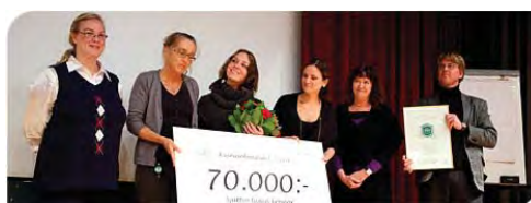
Kvinnoboendet Hera 2009